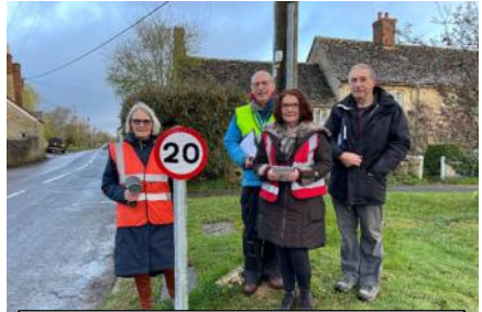
Members of the Church Hanborough Speedwatch Group

Don't let this be a wasted effort - please drive safe and keep others safe.